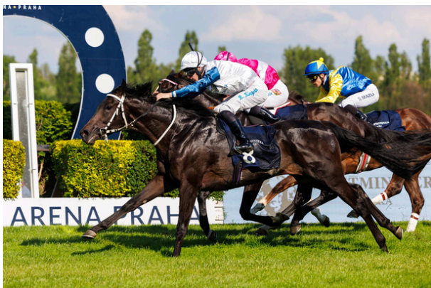
Naughty Peter (CZ) /// Chuchle Arena