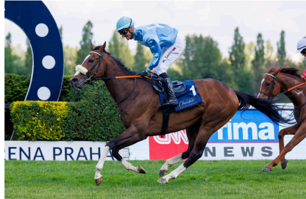
Rex of Thunder (GB) /// Chuchle Arena