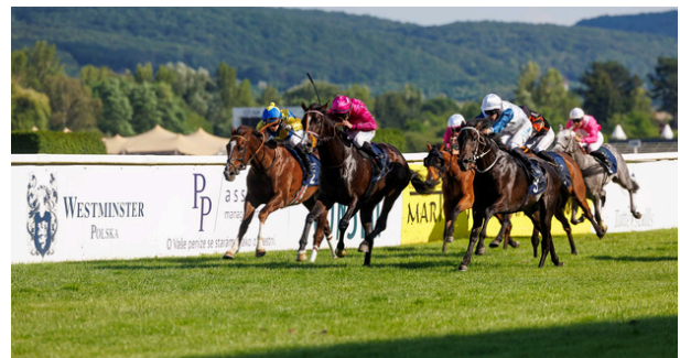
104th Czech Derby /// Chuchle Arena

The winner is a progeny of stallion Tai Chi , who from this year has stallion duties in France at Haras des Beaux stud farm for a fee of 2,500 euros. Dam Nebiola (GER) , Acatanengo (GER) , comes from a long-distance German family. She is currently at the Babolna stud farm in Hungary, where she foaled a full sister to the Derby winner this year. She also has a yearling filly by Footstepsinthesand .