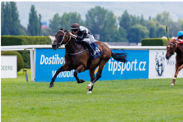
Worth Choice (IRE) /// Chuchle Arena