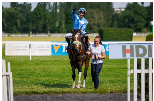
Rex of Thunder (GB) /// Chuchle Arena

https://www.youtube.com/watch?v=1oYp_rl87tl