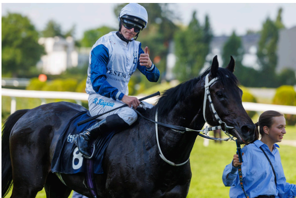
Naughty Peter (CZ) /// Chuchle Arena