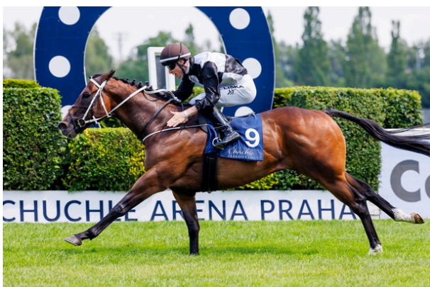
Worth Choice (IRE) /// Chuchle Arena

Emerald Bloodstock, Goffs sportsman sale 5.500eur, Volteo Horse service