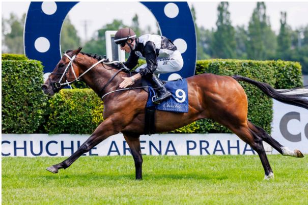
Worth Choice (IRE) /// Chuchle Arena