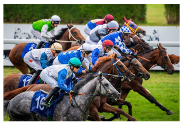
2024 Westminster Derby /// trafnews.pl

Nearing the end of the turn, Magnezja and Mister Ursus galloped effortlessly at the front, allowing them to overtake the weakening leader 600 meters before the finish line (Bali had already fallen back).