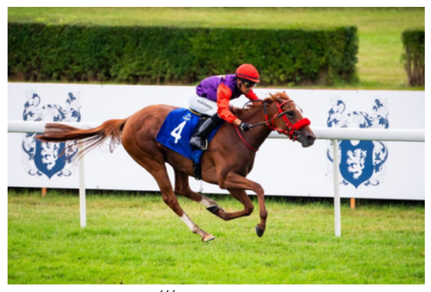
Magnezja (IRE)

During the spring 3yo season, two stars stood out. Zen Spirit , the winner of the Nagroda Strzegomia and Rulera races, was the top contender among colts, while Magnezja emerged as a dominant force among fillies. Both horses had taken a break from mid-May until the Derby, with neither tested over the distance before, but their trainers had confidence in their abilities. They were right.