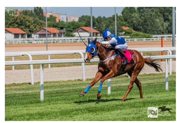
Guilin (IRE) /// ZL Ptohos