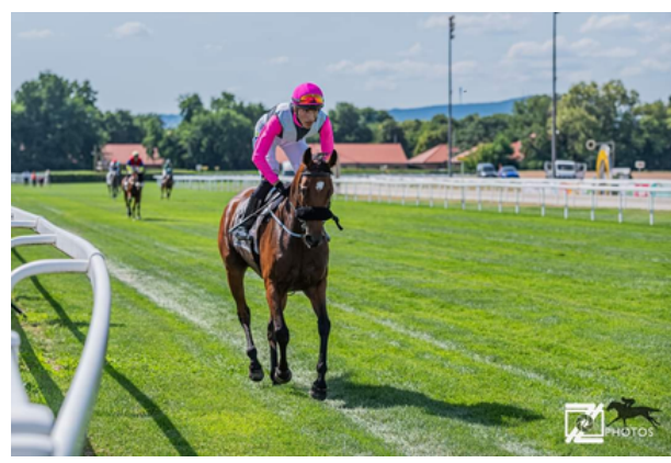
Reshiram (IRE) /// ZL Ptohos