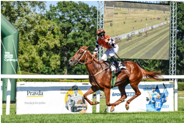
Anika (CZE)