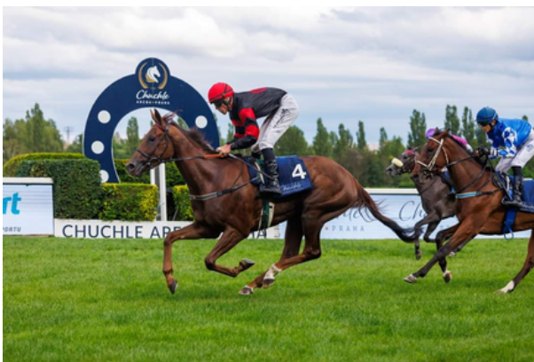
Quiera (IRE) /// Chuchle Arena