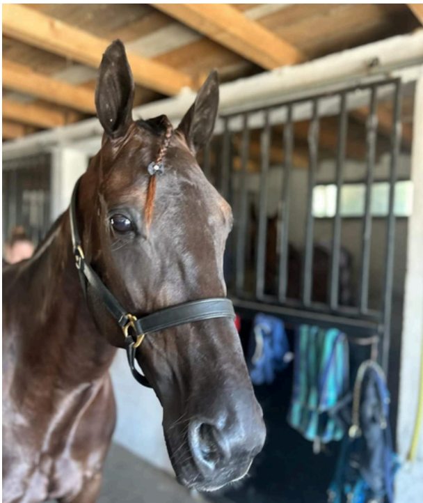
Zaire Wise As

Two qualifying races for the derby were also held, with Top Hill and Sinatra AT emerging as winners. They will lead the rest of the group in the derby. The second-placed in both races were the top two favorites for the race of a lifetime: Stan Getz AT and Bonadisea. Ada Love, Belina, Not So Fast, and Kiara De Sajan are the other participants in the race of a lifetime, which will be held in Sombor on August 11.