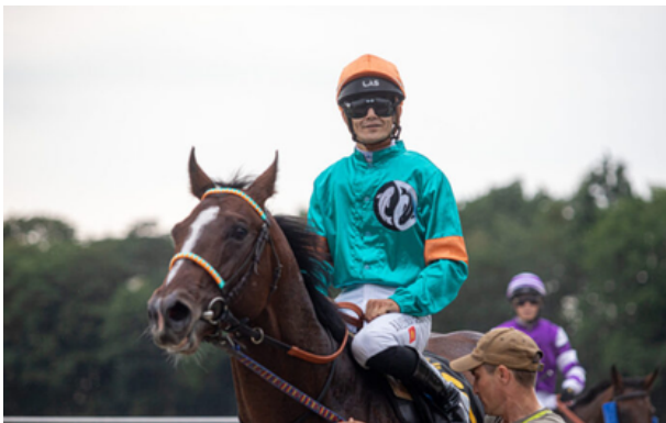
God Of War (POL)