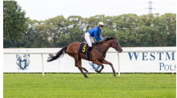
Dzersejka (POL)