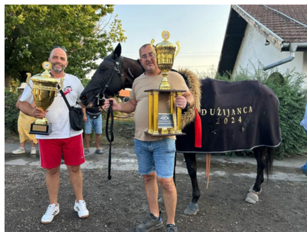
Zaire Wise As with his owners

In the first of two runs of the most prestigious trotting race in Serbia, Zaire Wise As , a 9-year-old colt ( Maharajah - Southwind Pamona ), set a new Serbian record of 1.12,5 . This stallion has been trotting excellently all season and confirmed his excellent form in the second run, where he was again the best, clocking a time of 1.14,4.