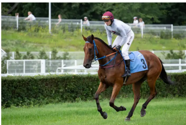
Boheme (GER)