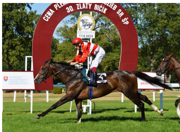
Gasparini (CZE)