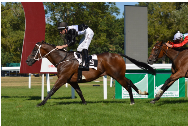
Worth Choice (IRE)

As expected by bettors, the most significant tests of the thirteenth race day of the season at the Staroháj Hippodrome, supported by the Breeding Services of the Slovak Republic, s.p., ended as anticipated. In the 30th Golden Whip, last year's triumph was defended by the exceptional WORTH CHOICE , the 34th Turf Prize belonged to the Bratislava favorite GASPARINI , and finally, in the 29th Whisky Prize, MUSTELA achieved her fourth victory of the year.