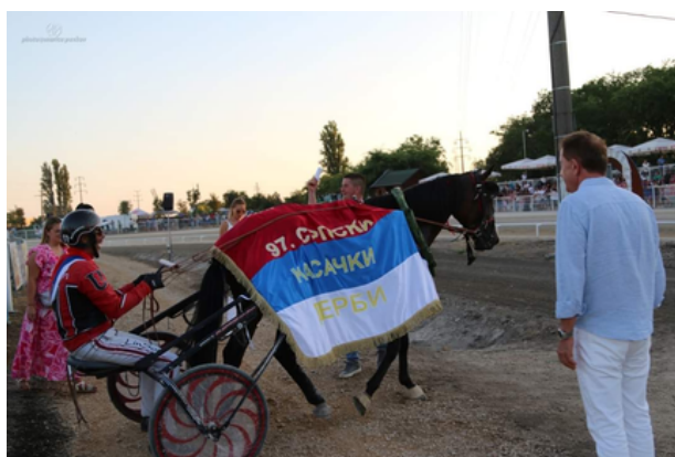
Sinatra AT