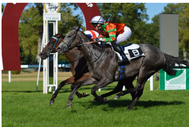
Mustela (IRE) barely winning