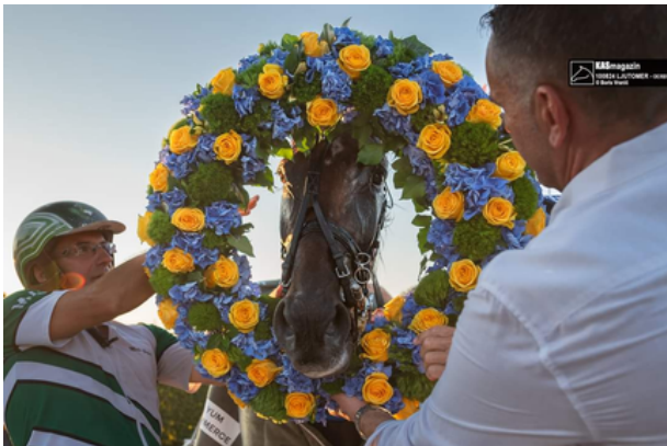
John Wish TP