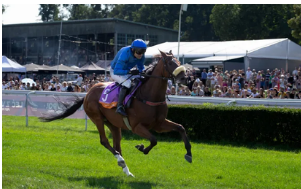
Ambrosius (GER)

In the second hurdle race of the day, for four-year-old and older horses, Marek Stromsky on Ambrosius adopted the same tactics as we saw in the previous race, and the other four horses galloped in close intervals. There were no significant changes until the turn before entering the back straight when Kraram had a slight problem with her jump for the first time. She galloped at the last position for a moment but quickly rejoined the group of horses, as the pace was moderate.