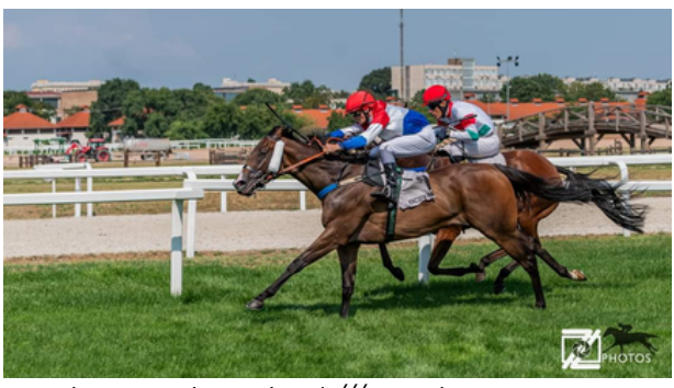
Muskateer Three (GB)