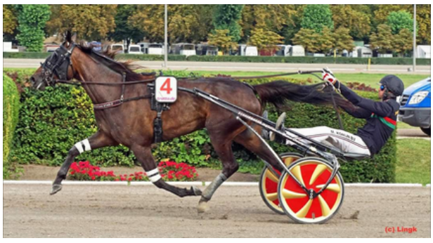
Speedrise Lady S

Two years ago, the 35-year-old Dutchman celebrated with Lumumba , and three years ago as well, and now he has climbed back onto the winner's podium designated for the Stuten Derby .