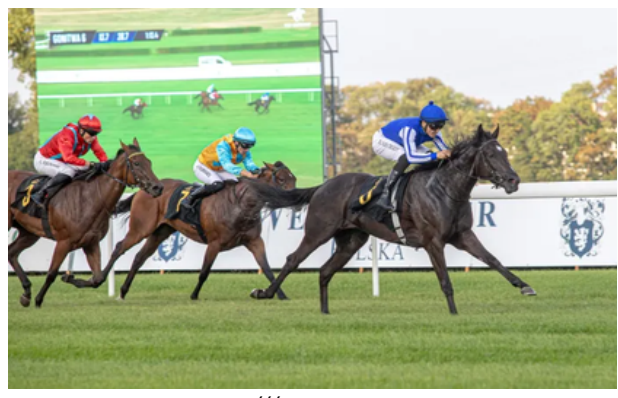
Smooth Sea (IRE) /// trafnews.pl

In the second race of the day for twoyear-olds, this time at Category II level, five horses also competed, but this race brought a big surprise. The heavy favorite Geia Sou Moro led strongly and halfway down the straight it seemed she would win by a margin. However, in the last 200 m, she completely ran out of steam and was first overtaken by the debutante Smooth Sea and then by Gold of Treville .